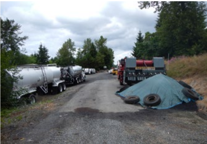
LOCATION 13 - Looking north with construction equipment and vehicle parking