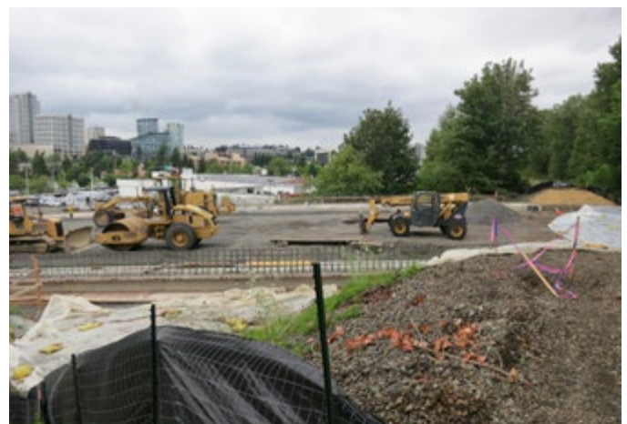
LOCATION 15 - Looking north with City of Bellevue NE 4th Street construction