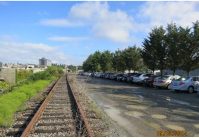
LOCATION 16 - Looking north with vehicle parking