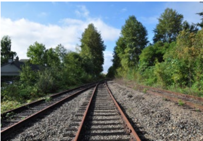
LOCATION 17 - Looking north