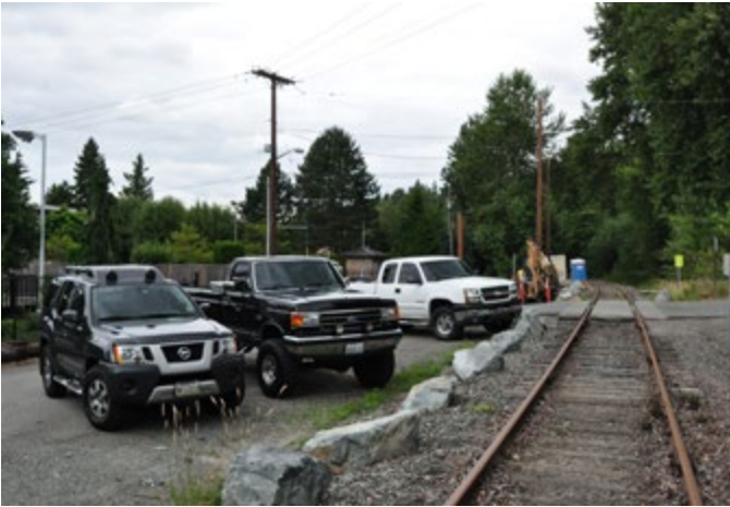
LOCATION 6 - Looking north with vehicle parking at Seahawks Way