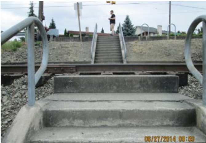
LOCATION 3 - Looking east with path and stairs to park