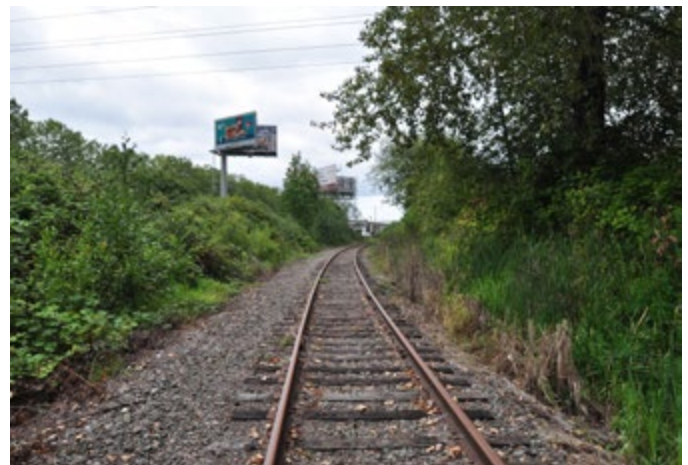
LOCATION 20 - Looking west with reduced right-of-way and billboards