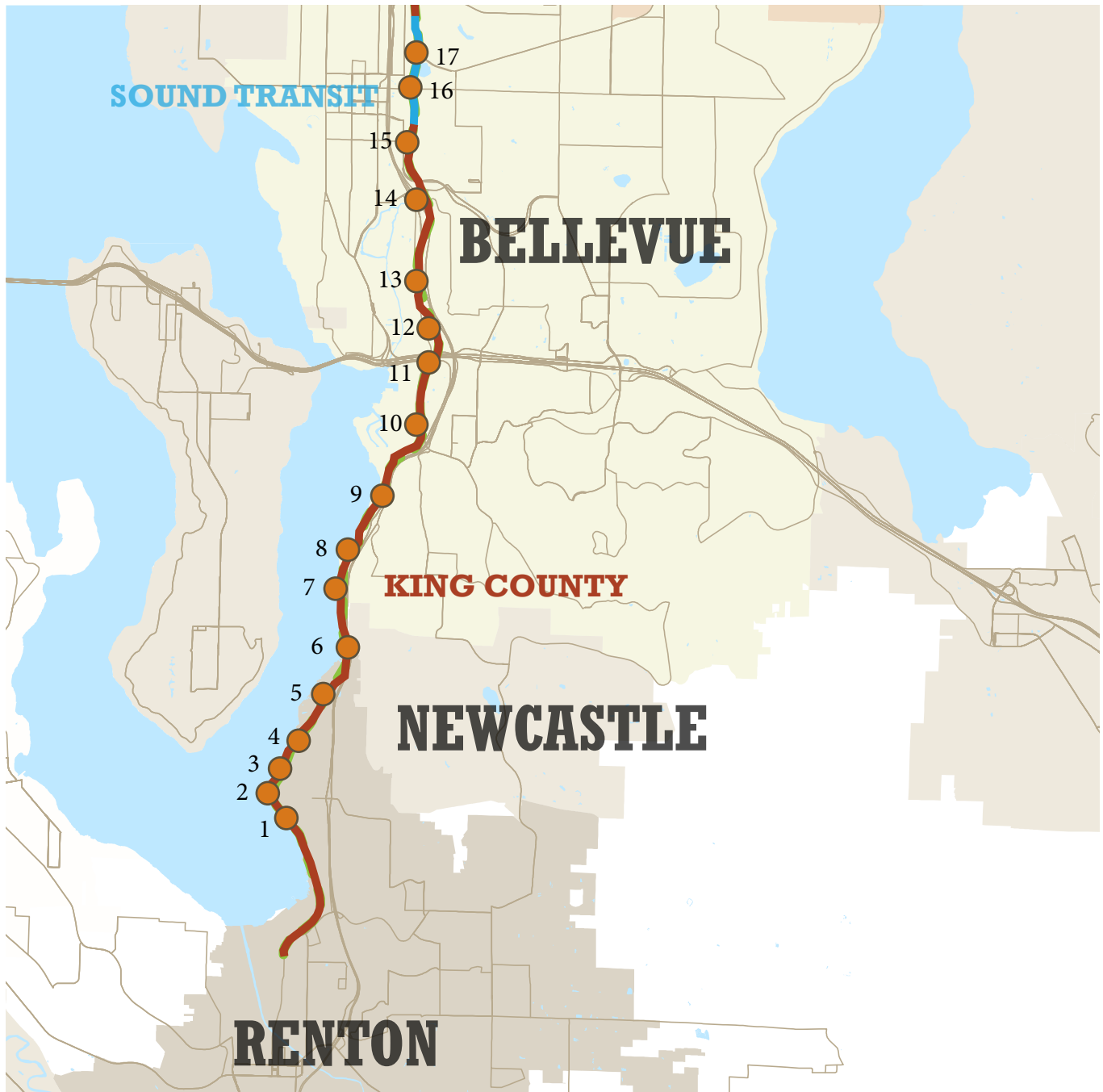
Figure 2 - Detailed South Corridor Constraints Description Key