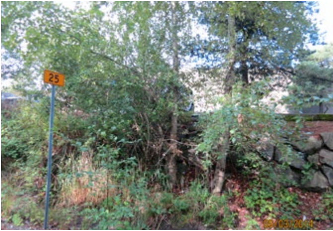
LOCATION 17 - Looking east at Lake Bellevue