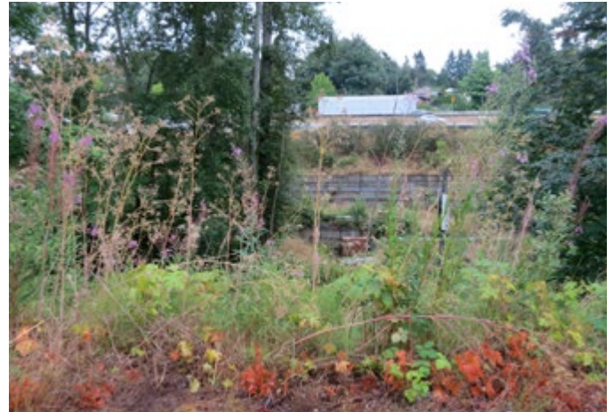
LOCATION 9 - Looking east with I-405 and shared-use path