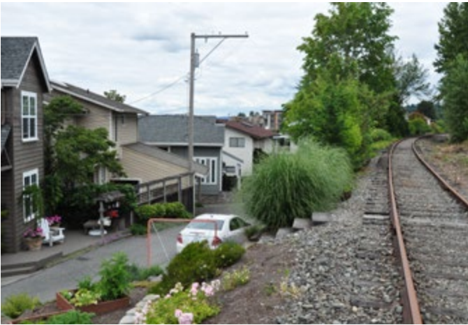
LOCATION 4 - Looking west with path and stairs and landscape improvements at North 37th Street