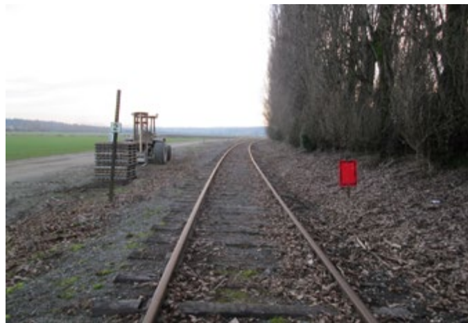
LOCATION 30 - Looking south at sod farm east of Chateau St. Michelle with farm equipment