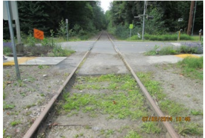
LOCATION 23 - Looking east at NE 145th Street