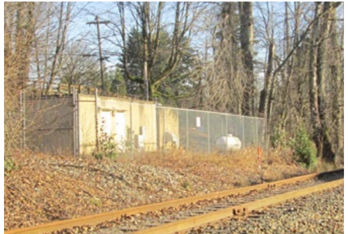
LOCATION 18 - Looking southeast with fenced utility structure adjacent to I-405 ramp