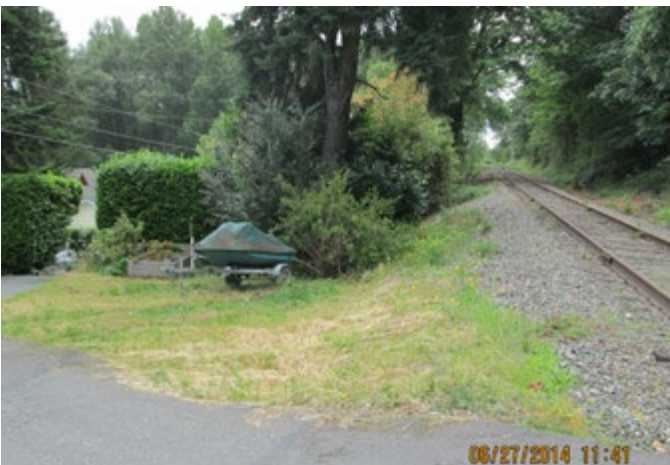
LOCATION 8 - Looking north with residential drive and boat/trailer parking