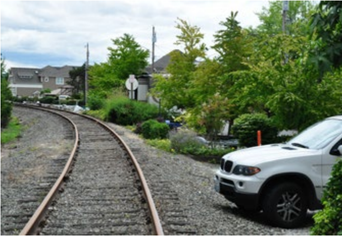
LOCATION 1 - Looking south with permanent accessory structure, vehicle parking and landscape improvements