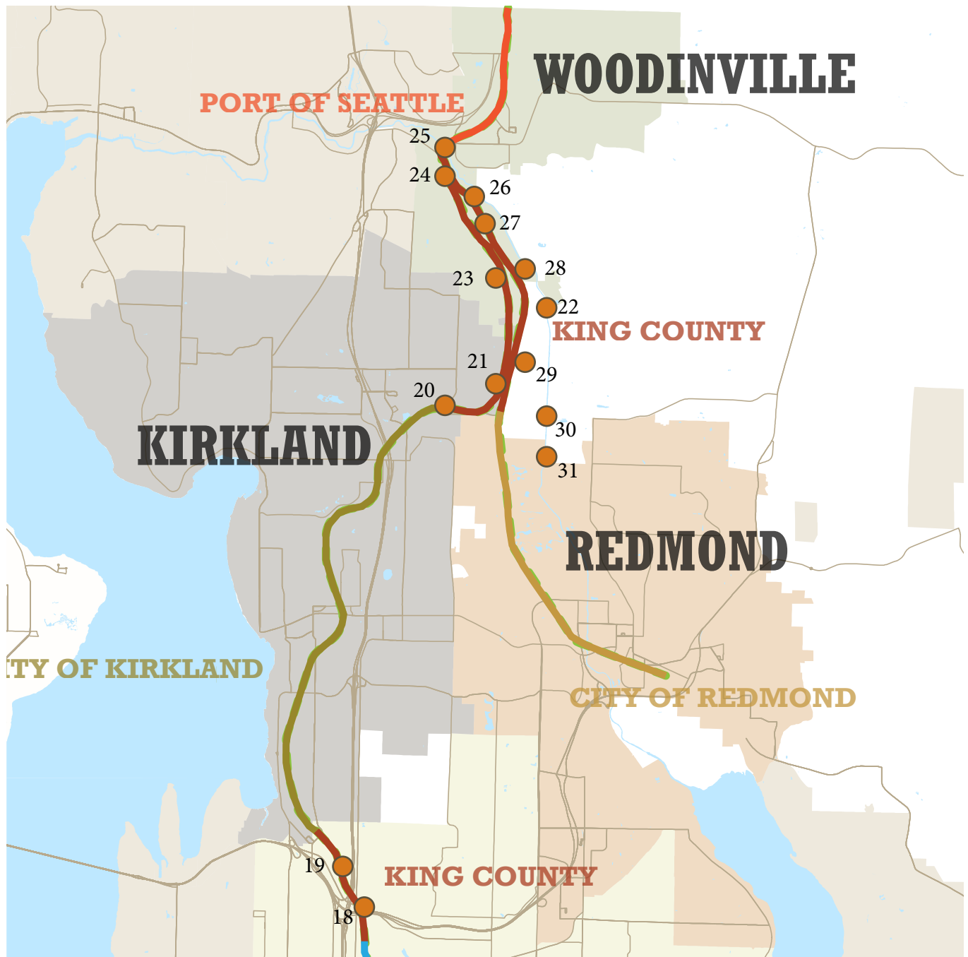
Figure 3 - Detailed North Corridor Constraint Description Key