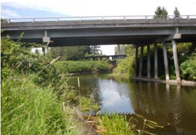
LOCATION 25 - Looking northwest at NE 175th Street over Sammamish River