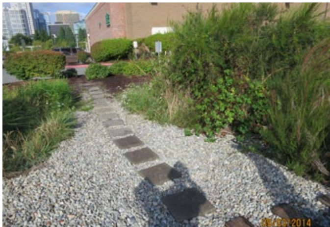
LOCATION 16 - Looking west with formal paths and landscape improvements