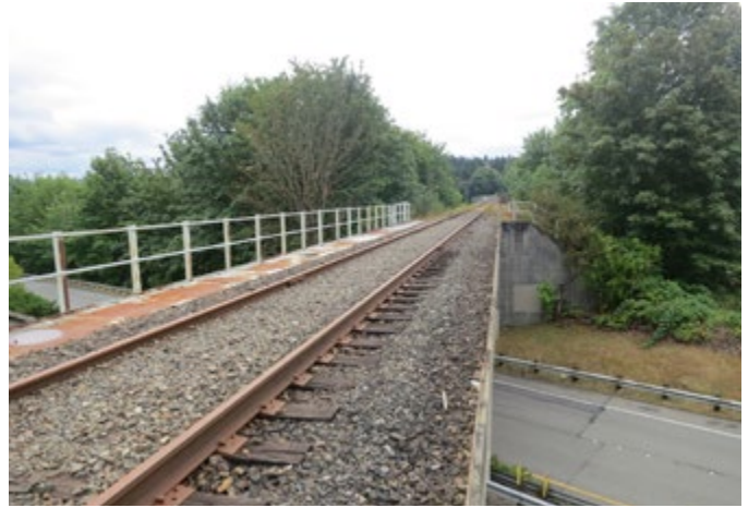
LOCATION 14 - Looking southeast at the Lake Hills Connector trestle