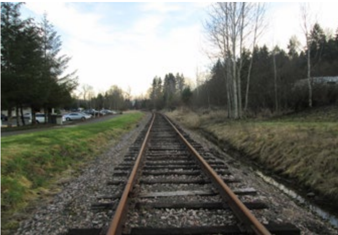
LOCATION 29 - Looking south at asphalt path in front of Cosco Fire Protection