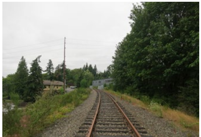
LOCATION 11 - Looking north