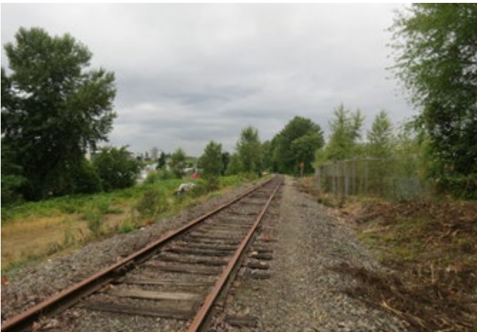
LOCATION 15 - Looking north with Home Depot fencing (right)