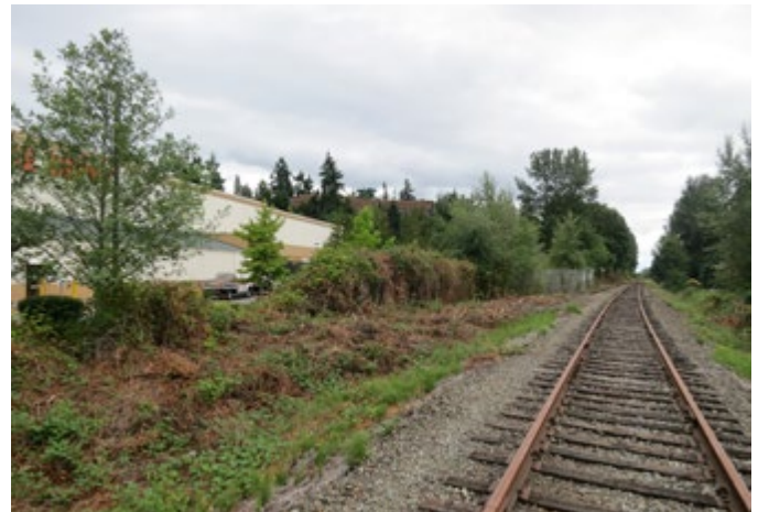
LOCATION 15 - Looking south with Home Depot fencing