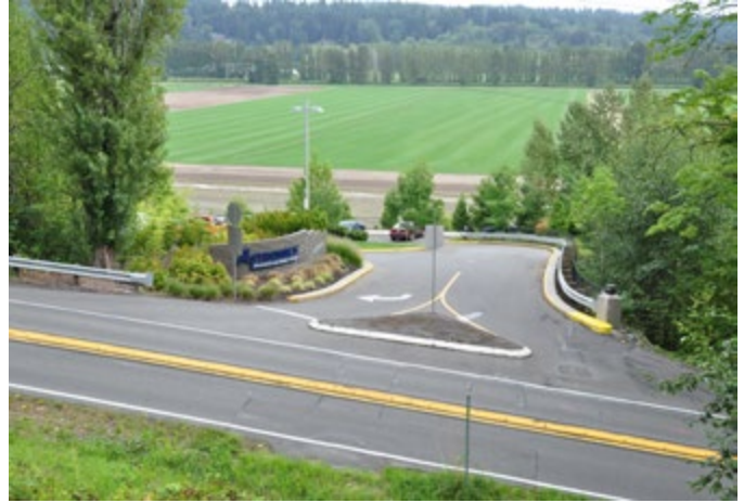
LOCATION 21 - Looking east to driveway off Willows Road NE