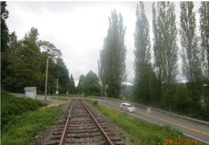
LOCATION 21 - Looking north at Willows Road NE