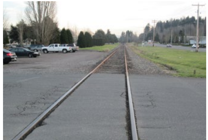
LOCATION 28 - Looking south at driveway and additional gravel parking south of locations above