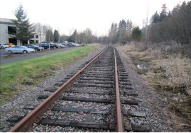
LOCATION 29 - Looking south at asphalt path in front of Cosco Fire Protection