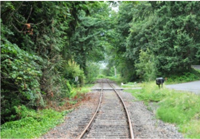
LOCATION 8 - Looking north with residential driveway access