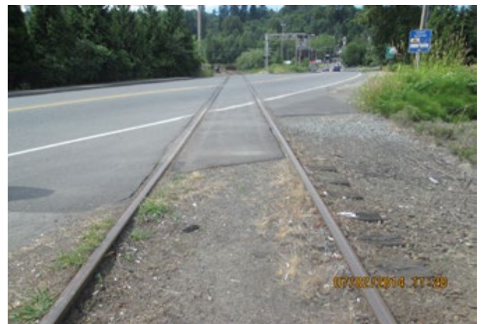
LOCATION 25 - Looking southeast at SR 202/Woodinville-Redmond Road