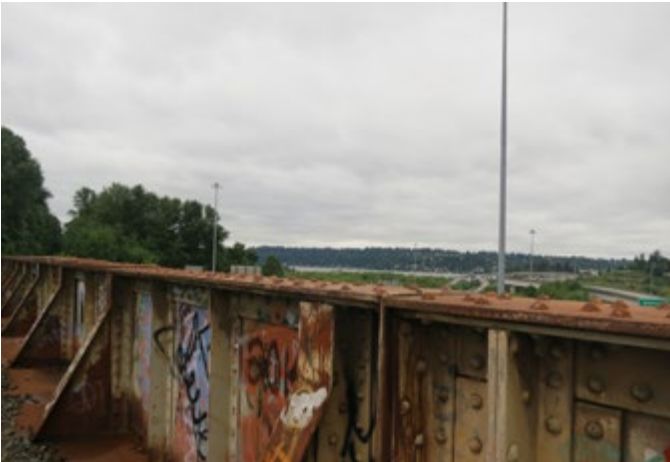
LOCATION 11 - Looking southwest