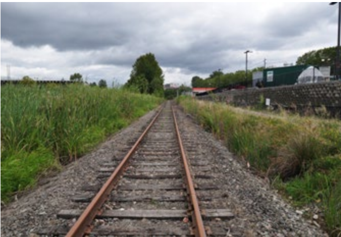
LOCATION 20 - Looking east with reduced right-of-way and adjacent business