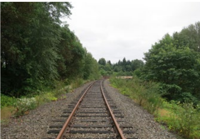
LOCATION 11 - Looking south