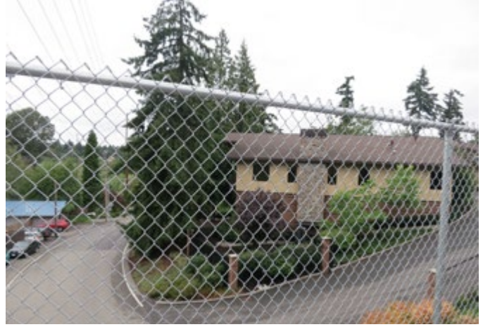
LOCATION 12 - Looking west at SE 32nd Street trestle