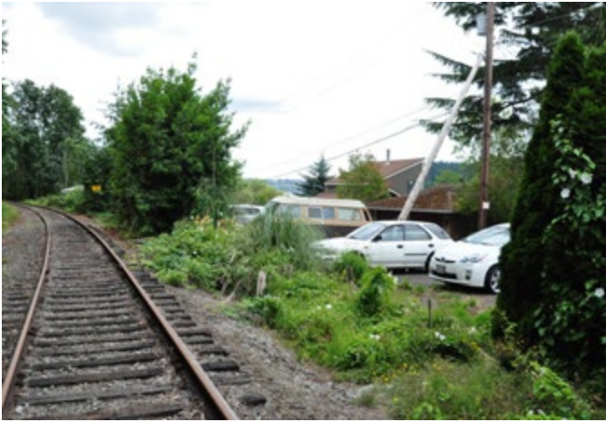
LOCATION 7 - Looking south with landscape improvements and vehicle parking