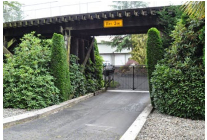
LOCATION 6 - Looking west at gated access and landscape improvements at Ripley Lane