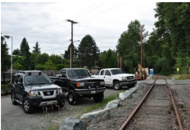
Accessory parking is a common existing use in the ERC

Many of the locations where the corridor is reduced in width are limited in length. These “pinch-points” in the ERC can provide serious challenges for trail planning, but are often easier to resolve than longer reductions in the corridor. There are also locations where long stretches of the corridor are reduced. These areas create extensive challenges for accommodating the potential range of uses envisioned by the RAC for the corridor.