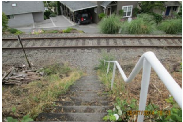
Vehicle and pedestrian access to adjacent homes is a common use in the ERC at the southern end of the corridor

Below are four key segments along the corridor where there are locations with extensive reductions to the functional right-of-way.