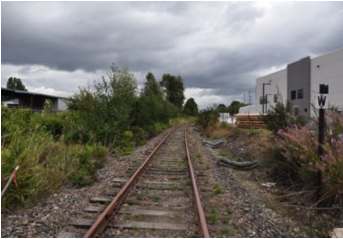
LOCATION 20 - Looking east with reduced right-of-way and adjacent business