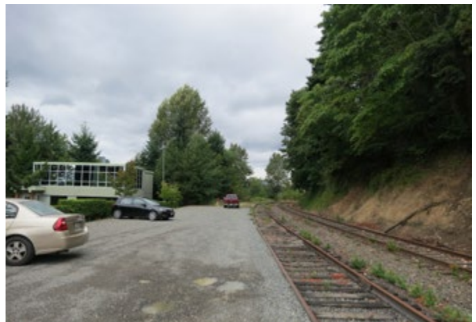
LOCATION 14 - Looking north from SE 5th Street with vehicle parking