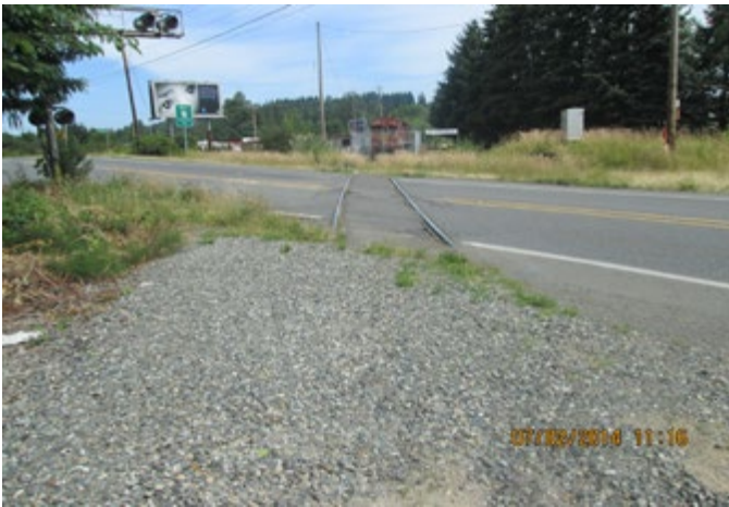
LOCATION 25 - Looking north at SR 202/Woodinville-Redmond Road with box car and train engine, billboards and vehicle parking