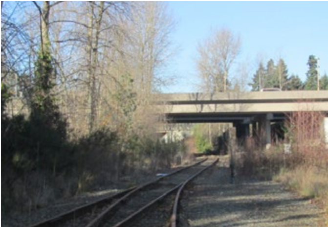
LOCATION 18 - Looking west towards SR 520 ramps