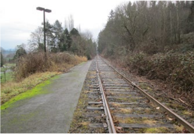
LOCATION 22 - Looking south