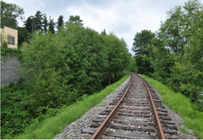
LOCATION 21 - Looking north