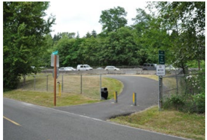
LOCATION 6 - Looking northeast at trail access from Seahawks Way