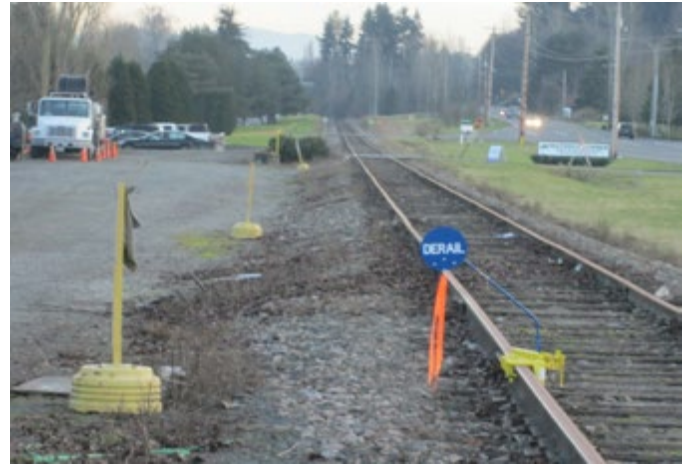
LOCATION 28 - Looking south towards parking area adjacent to Matheus Lumber and driveways