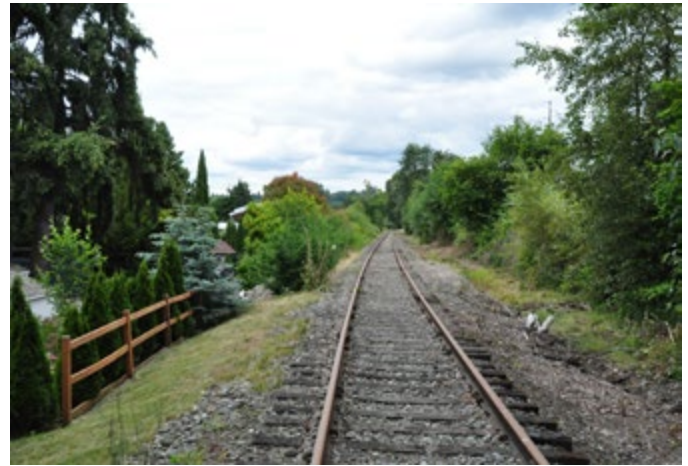
LOCATION 4 - Looking north with fence