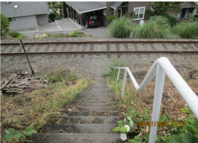
LOCATION 4 - Looking west with path and stairs at North 37th Street