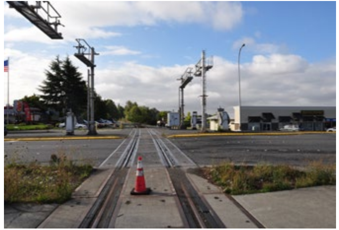
LOCATION 16 - Looking north at NE 8th Street