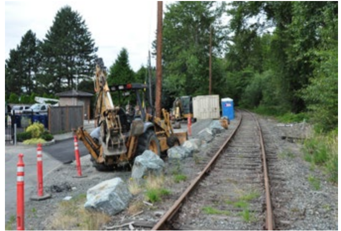
LOCATION 6 - Looking north with construction vehicle parking and storage