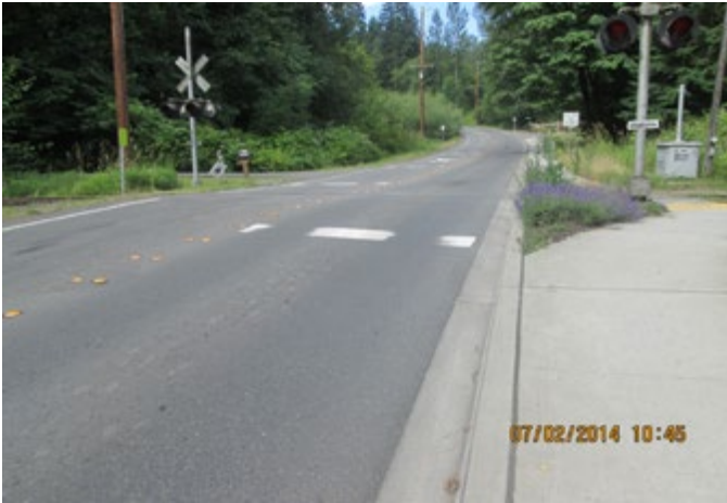
LOCATION 23 - Looking south at NE 145th Street with City of Woodinville sidewalks and landscape improvements