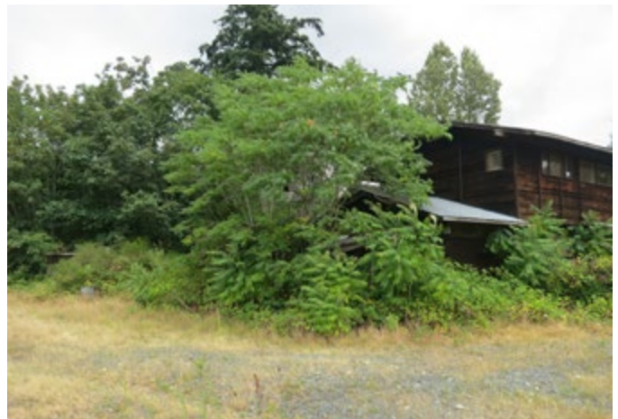
LOCATION 14 - Looking northeast at SE 5th Street with residential structure