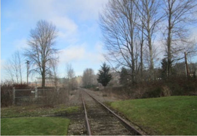
LOCATION 5 - Looking north towards former Barbee Mill property with boundary fence (left)