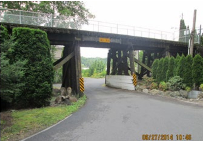
LOCATION 6 - Looking west at landscape improvements on Ripley Lane