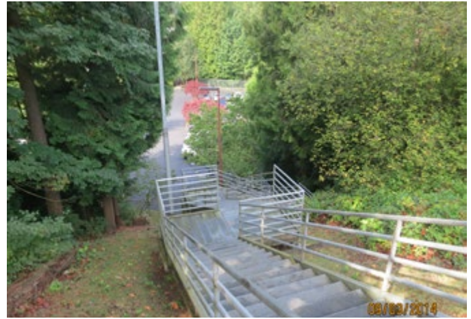
LOCATION 19 - Looking south at formal stair access