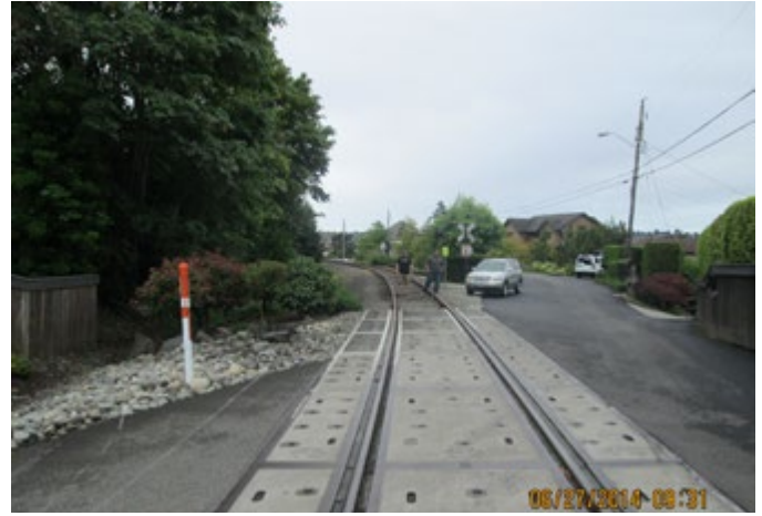
LOCATION 2 - Looking south