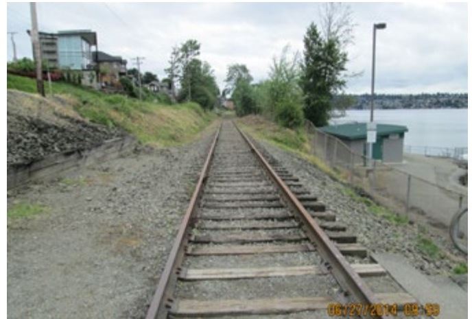
LOCATION 3 - Looking south