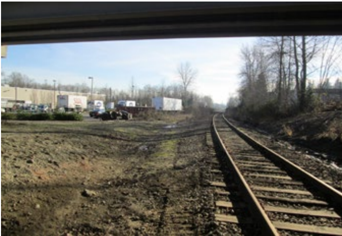
LOCATION 18 - Looking east from under SR 520 at equipment storage and vehicle parking