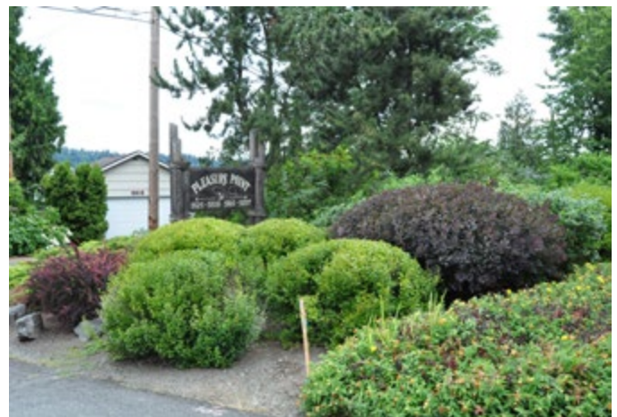
LOCATION 7 - Looking southwest with landscape improvements and neighborhood sign