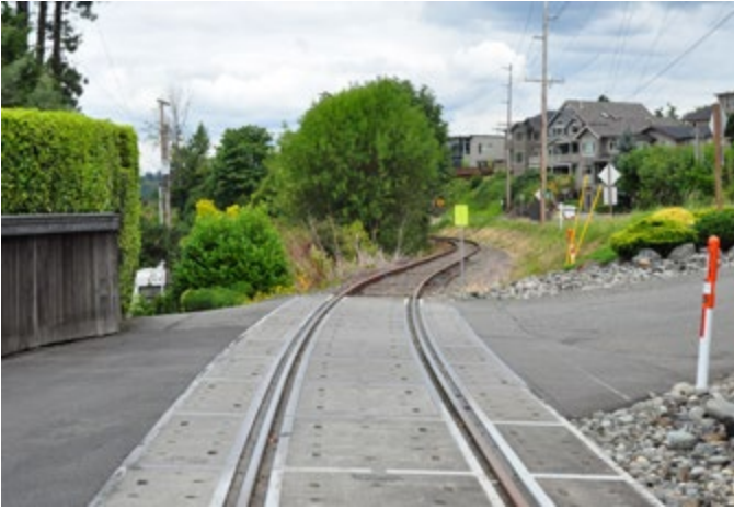
LOCATION 2 - Looking north