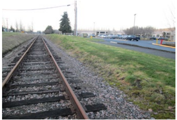
LOCATION 29 - Looking north at asphalt path in front of Cosco Fire Protection