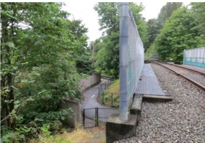
LOCATION 9 - Looking north at 106th Avenue SE trestle and shared-use path (left)