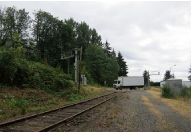
LOCATION 15 - Looking south at SE 1st Street and maintenance access road