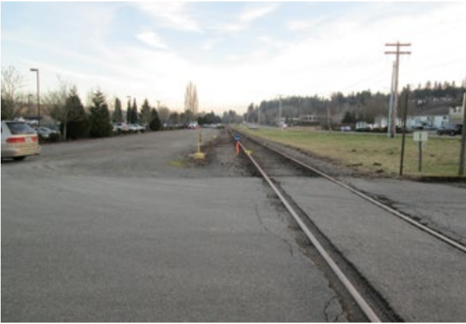
LOCATION 28 - Looking south towards parking area adjacent to Matheus Lumber