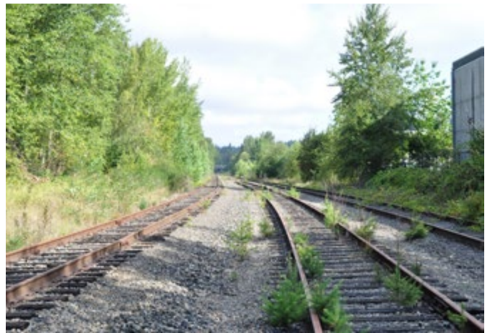
LOCATION 17 - Looking north