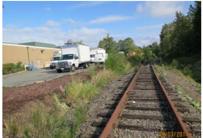
LOCATION 16 - Looking north, north of NE 8th Street