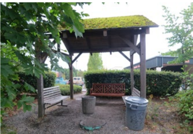
LOCATION 15 - Looking east with Home Depot employee accessory structure