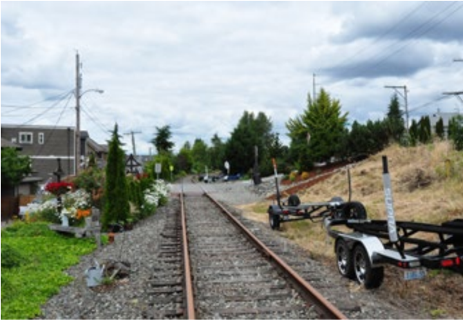
LOCATION 4 - Looking north with landscape improvements and vehicle storage