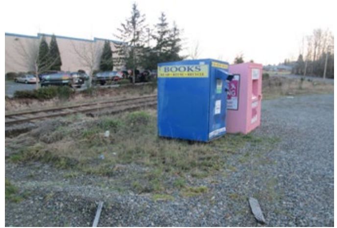
LOCATION 27 - Looking southeast towards rail with large graveled area used for parking and accessory structures