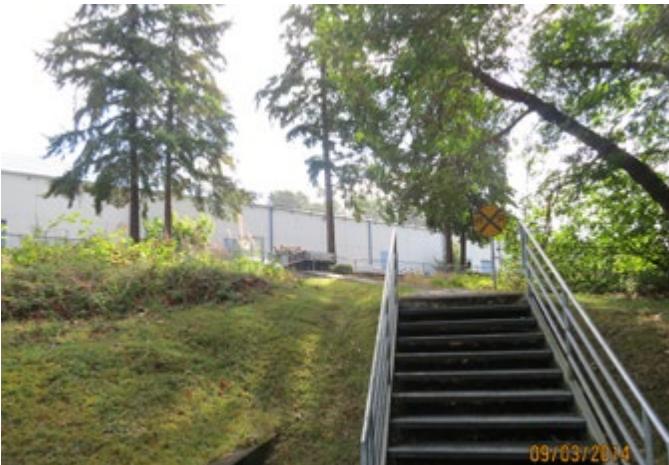
LOCATION 19 - Looking north at formal stair access