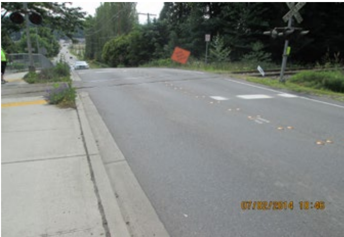
LOCATION 23 - Looking north at NE 145th Street with City of Woodinville sidewalks and landscape improvements