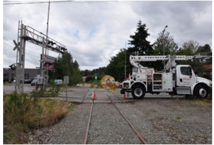
LOCATION 20 - Looking west to City of Kirkland Cross Kirkland Corridor