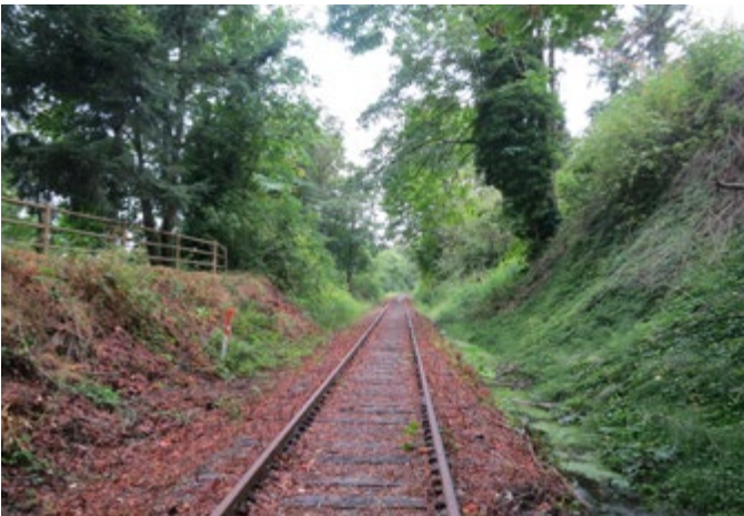
LOCATION 10 - Looking north with residential fence