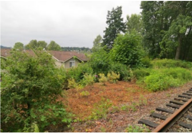
LOCATION 10 - Looking northwest with landscape improvements