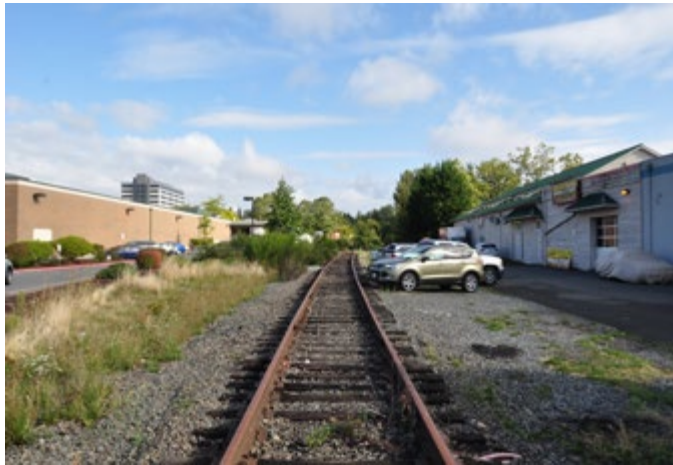
LOCATION 16 - Looking north at NE 8th Street