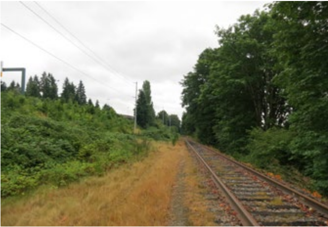
LOCATION 13 - Looking south