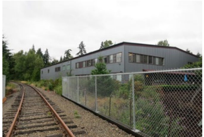
LOCATION 12 - Looking northeast