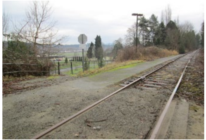
LOCATION 22 - Looking southeast towards winery and winery maintenance driveway