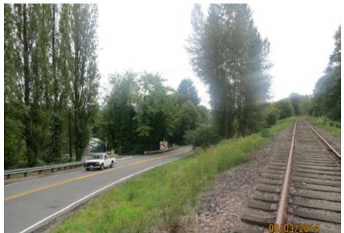
LOCATION 21 - Looking south at Willows Road NE with private building and accessory structure