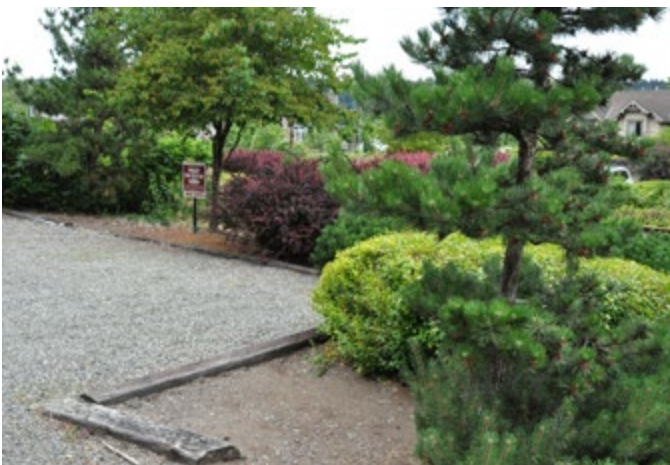
LOCATION 7 - Looking southwest with residential parking