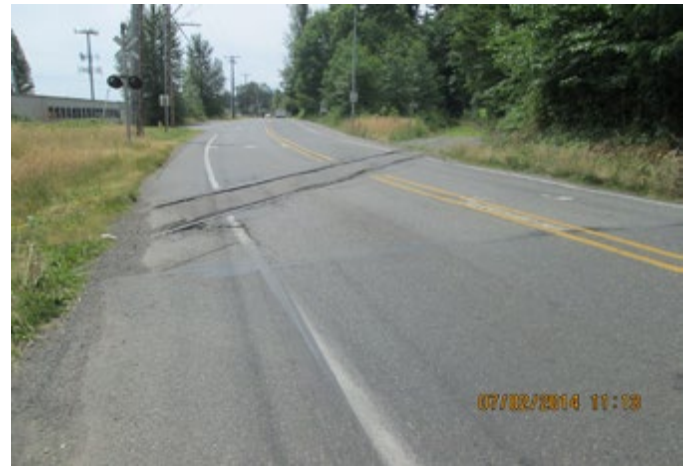
LOCATION 25 - Looking east at SR 202/Woodinville-Redmond Road