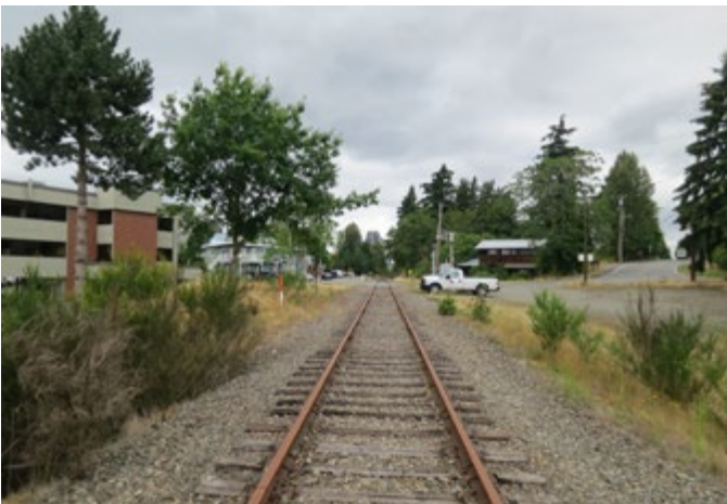
LOCATION 14 - Looking north to SE 5th Street and vehicle parking