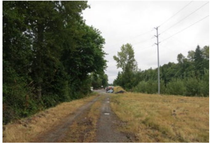
LOCATION 13 -Looking north with rails removed and construction equipment parking across ERC