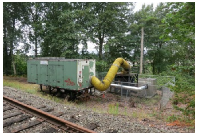
LOCATION 15 - Looking west at King County wastewater transfer station