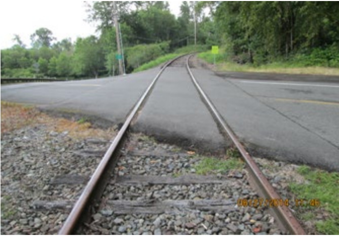
LOCATION 9 - Looking north at Newport Beach Park