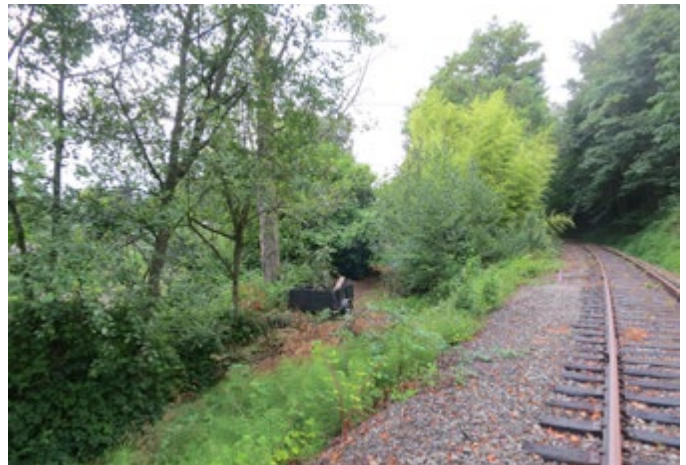
LOCATION 10 - Looking north with landscape improvements and debris disposal