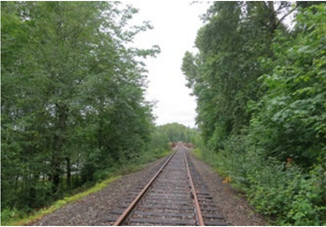
LOCATION 11 - Looking north