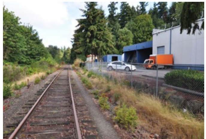
LOCATION 19 - Looking west with City of Bellevue vehicle parking and fencing