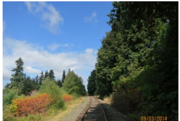
LOCATION 19 - Looking west