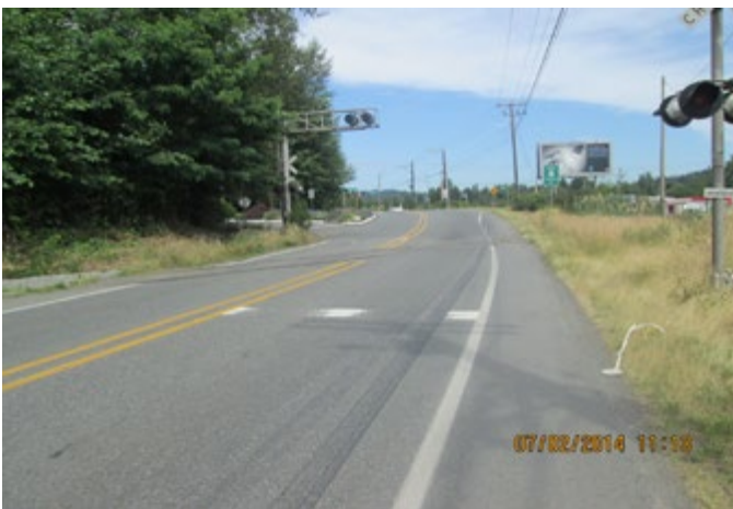
LOCATION 25 - Looking west at SR 202/Woodinville-Redmond Road with billboards