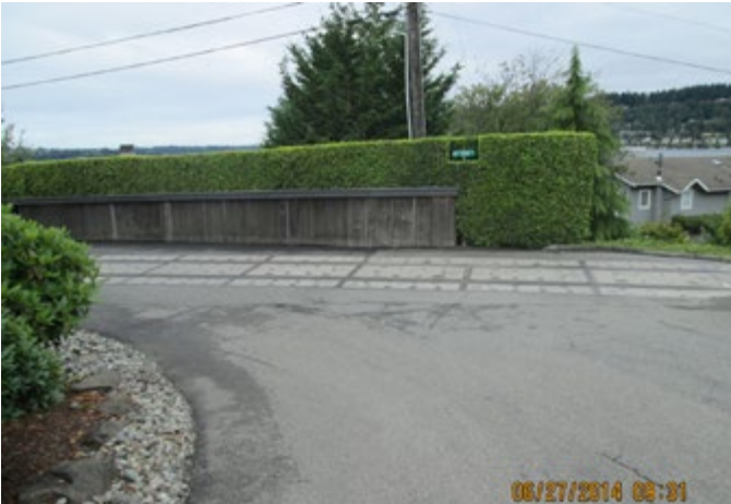
LOCATION 2 - Looking west with landscape screen and fence for adjacent home