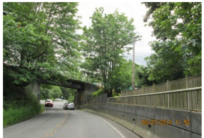
LOCATION 9 - Looking east from 106th Avenue SE trestle and shared-use path (right)