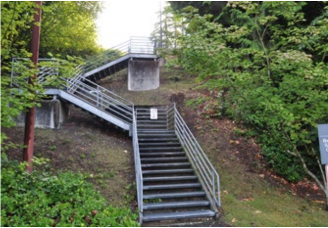
LOCATION 19 - Looking north at formal stair access