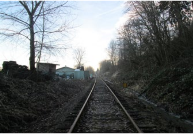
LOCATION 24 - Looking east with vehicle parking and equipment storage within ERC and structure abutting right-of-way