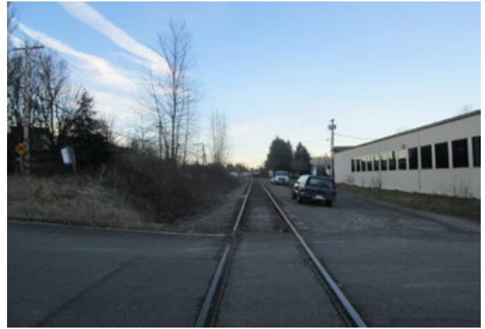
LOCATION 26 - Looking north towards business/parking lot