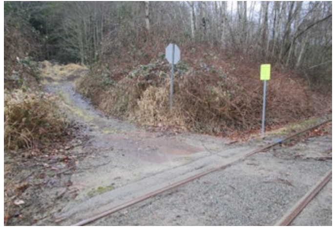
LOCATION 22 - Looking east towards winery and winery path