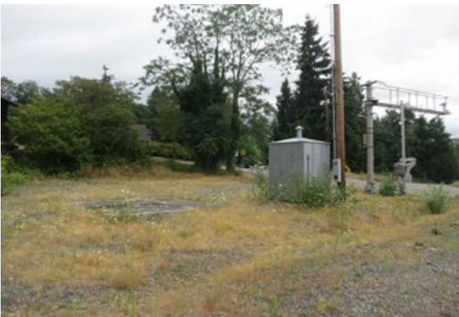
LOCATION 14 - Looking southeast at SE 5th Street with crossing structures