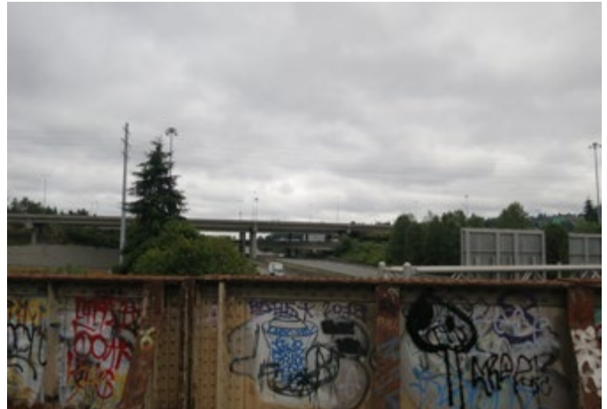
LOCATION 11 - Looking east at trestle