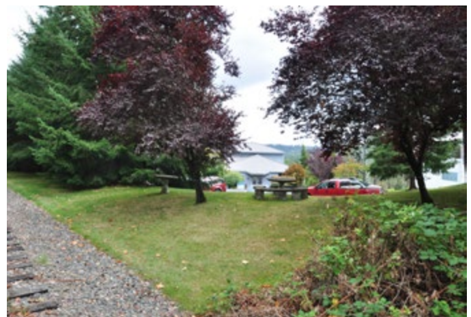
LOCATION 20 - Looking southeast with employee seating and landscape improvements