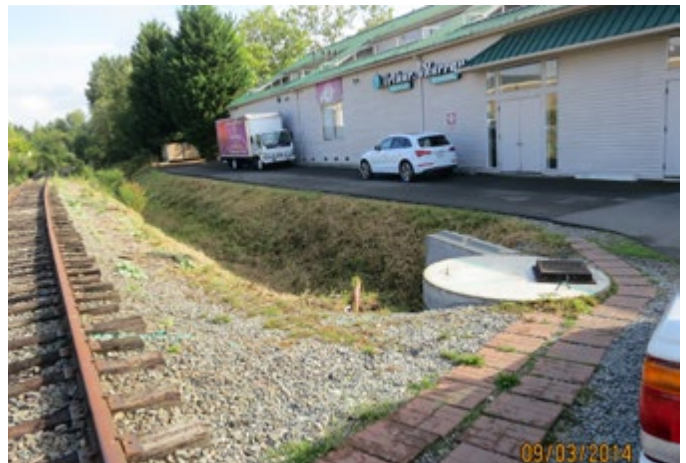
LOCATION 16 - Looking northeast with formal paths and landscape improvements