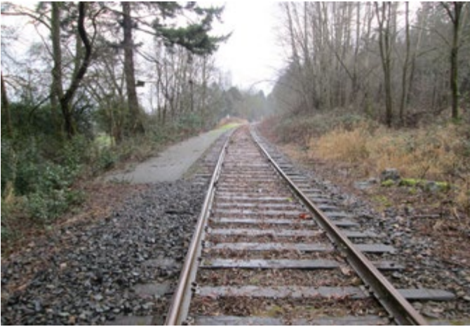
LOCATION 22 - Looking south towards path along rail