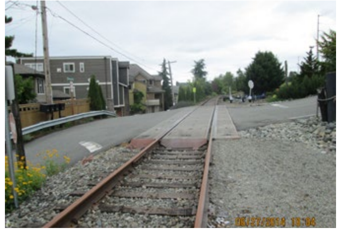
LOCATION 4 - Looking north