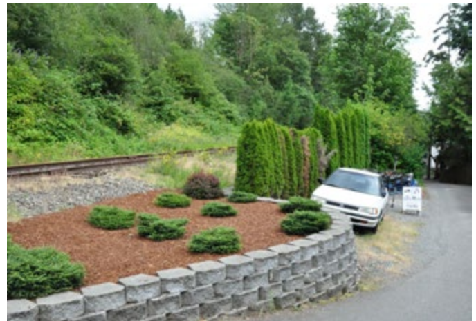
LOCATION 7 - Looking south with residential parking, landscape improvements, and retaining walls