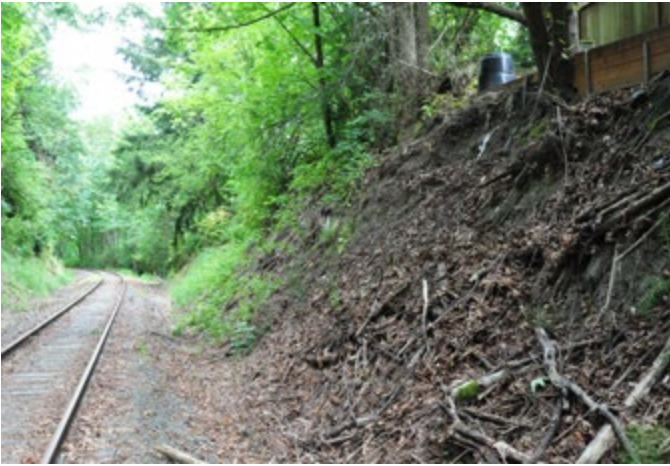
LOCATION 8 - Looking south