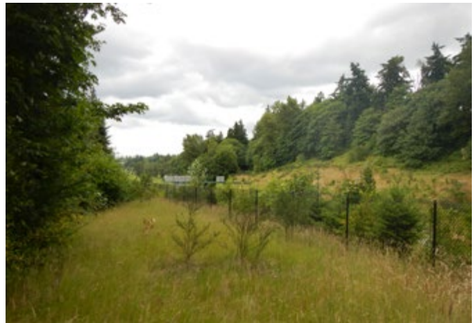
LOCATION 13 - Looking northeast where ERC meets I-405 right-of-way