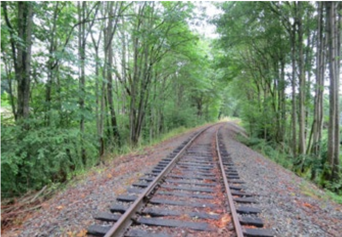
LOCATION 9 - Looking south