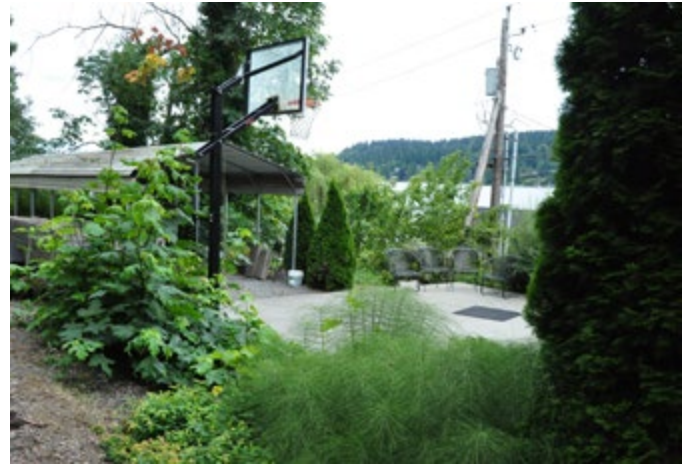
LOCATION 7 - Looking southwest with accessory structure, patio slab, and landscape improvements