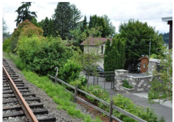
LOCATION 4 - Looking southwest with fence