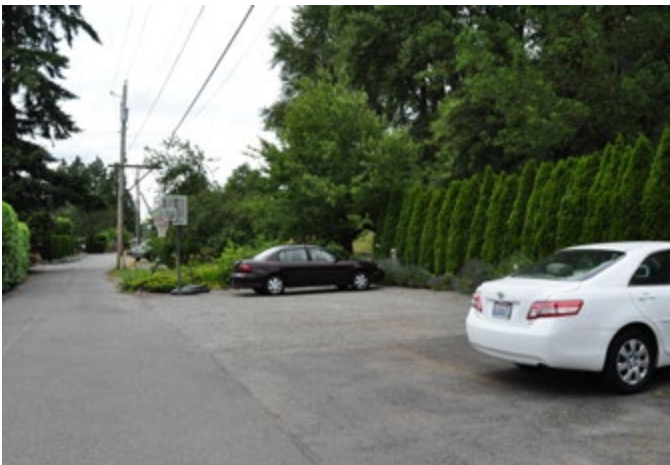
LOCATION 7 - Looking south with vehicle parking and landscape improvements