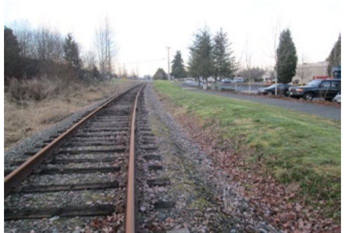
LOCATION 29 - Looking north at asphalt path in front of Cosco Fire Protection