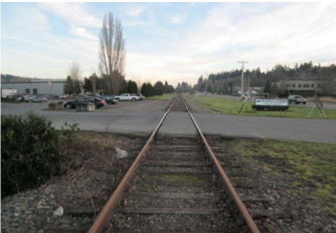
LOCATION 28 - Looking south towards driveway and additional gravel parking south of locations above