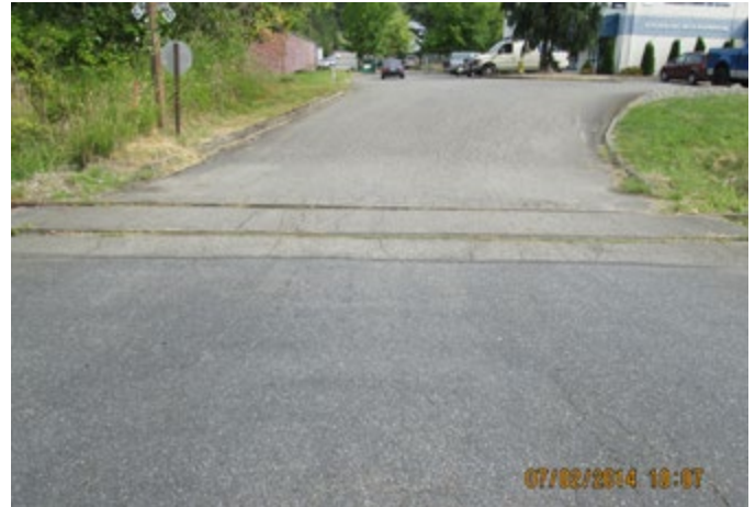
LOCATION 2 - Looking west with vehicle access