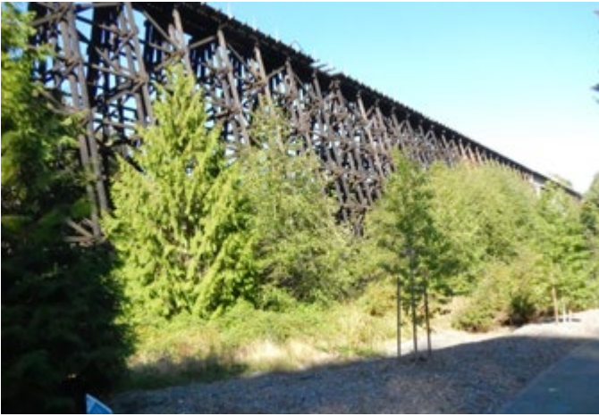
LOCATION 14 - Looking northwest at the Wilburton Trestle