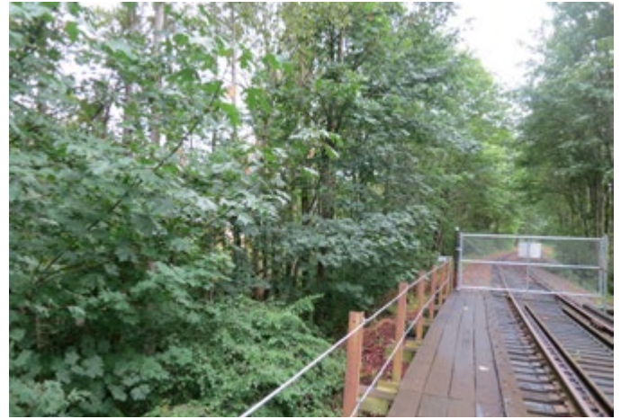
LOCATION 9 - Looking south at Coal Creek trestle