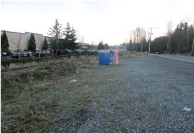
LOCATION 27 - Looking southeast towards rail with large graveled area