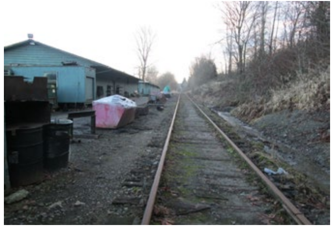
LOCATION 24 - Looking east with vehicle parking and equipment storage within ERC and structure abutting right-of-way