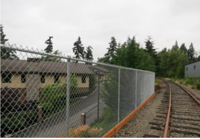
LOCATION 12 - Looking north at SE 32nd Street trestle