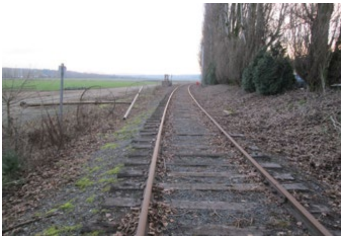
LOCATION 30 - Looking south at sod farm east of Chateau St. Michelle with irrigation equipment