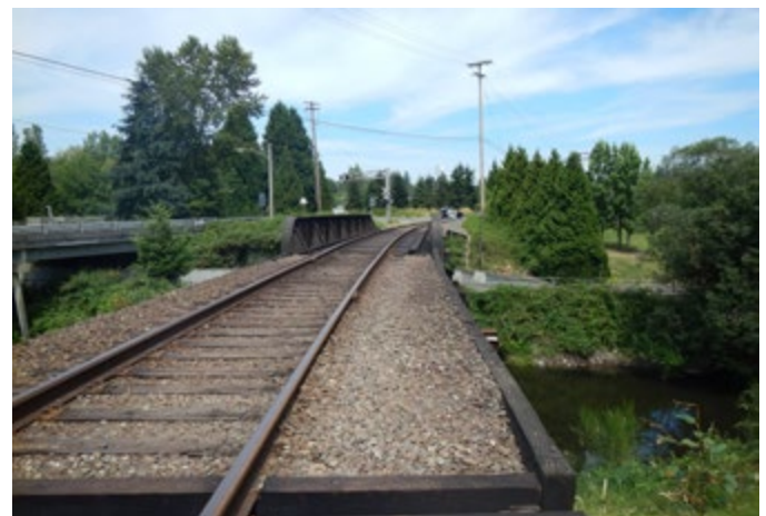
LOCATION 25 - Looking northeast at bridge trestle over Sammamish River to Wilmot Gateway Park and Sammamish River Trail