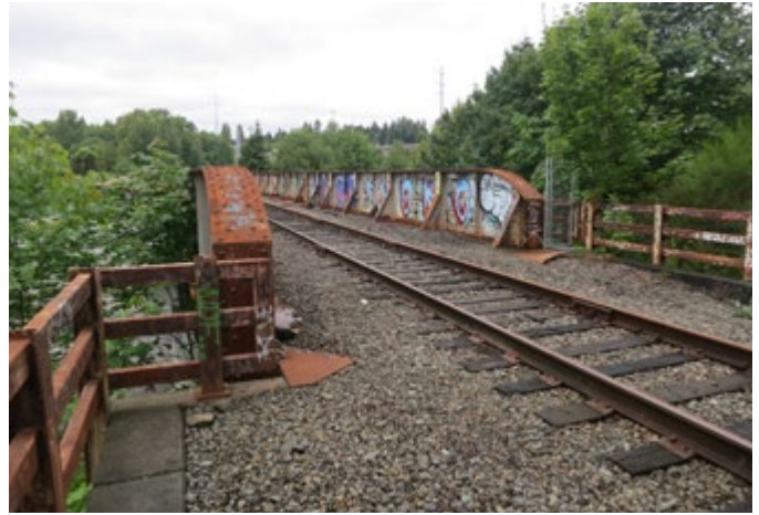
LOCATION 11 - Looking north at trestle