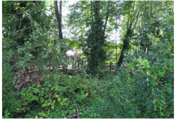
LOCATION 17 - Looking east at Lake Bellevue