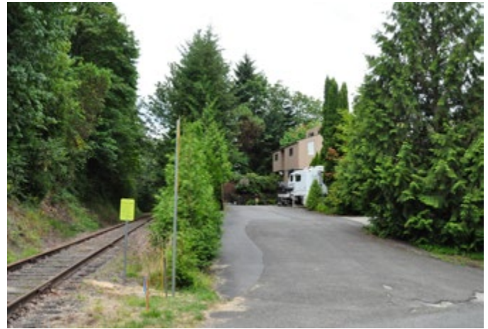
LOCATION 8 - Looking south with residential driveway access