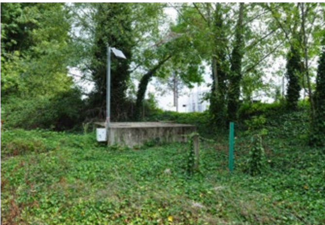
LOCATION 20 - Looking southeast