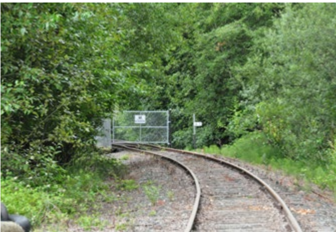
LOCATION 6 - Looking north at rail trestle over Ripley Lane