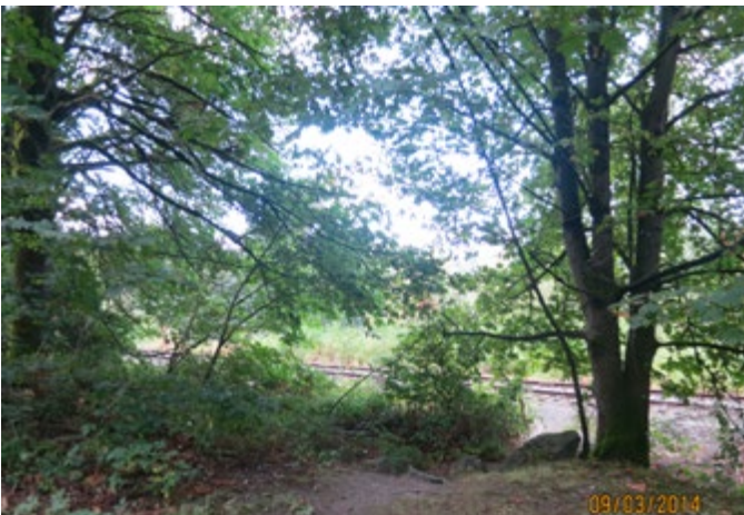
LOCATION 19 - Looking south at informal foot path from private park