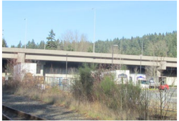
LOCATION 18 - Looking west at accessory building, equipment storage, fence, wall structure, and parking