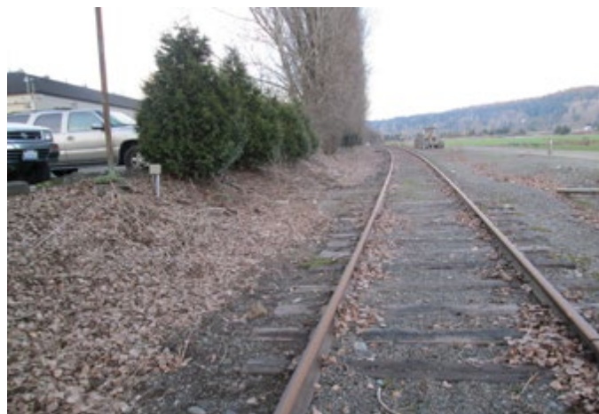
LOCATION 30 - Looking north