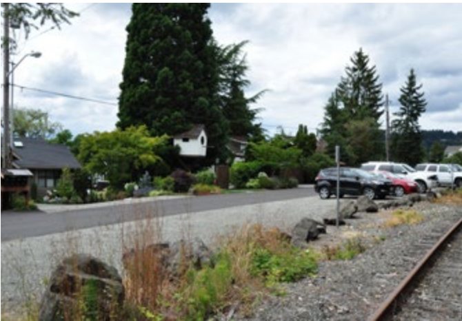
LOCATION 1 - Looking northwest with residential parking