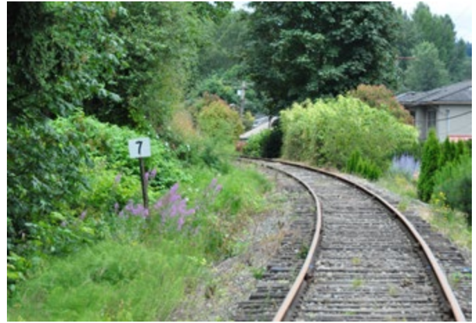
LOCATION 8 - Looking south