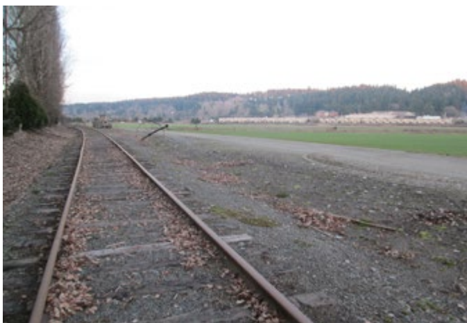
LOCATION 30 - Looking northeast