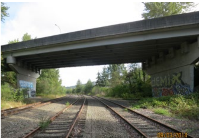
LOCATION 17 - Looking north at NE 12th Street