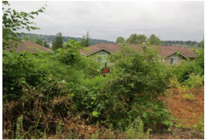
LOCATION 10 - Looking west with landscape improvements