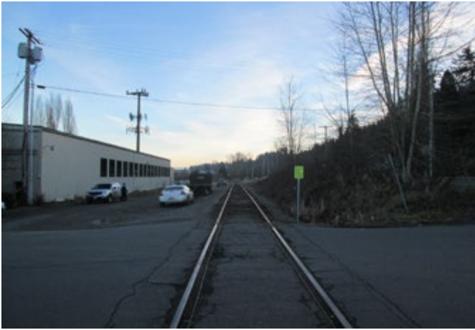
LOCATION 26 - Looking south towards business/parking lot