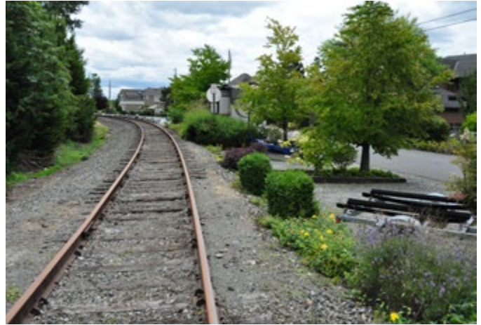
LOCATION 1 - Looking south with ornamental landscape improvements and vehicle parking