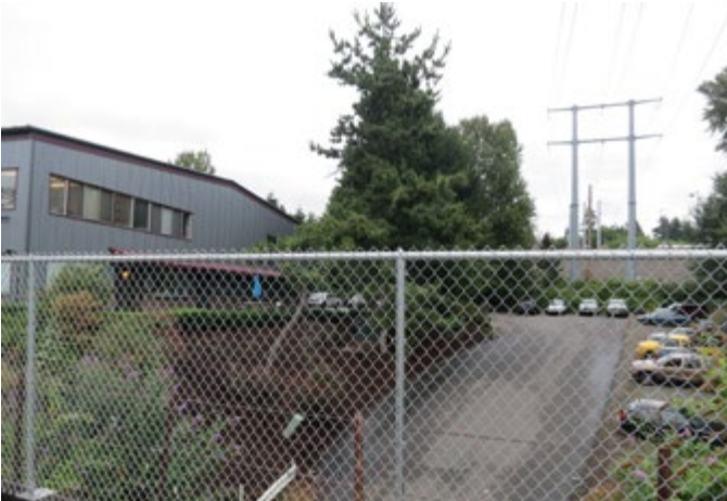
LOCATION 12 - Looking east at SE 32nd Street trestle to I-405 with vehicle parking and utility lines